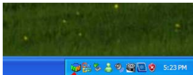
Minimized MindMapper Launcher Icon

Your taskbar shows the MindMapper Launcher icon when minimized